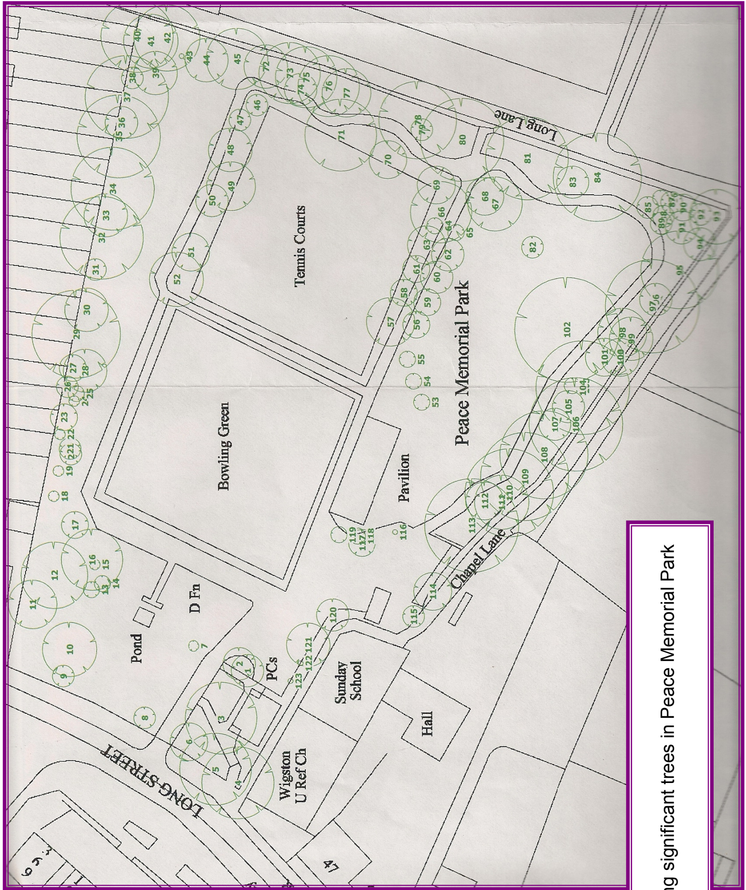
Plan showing significant trees in Peace Memorial Park